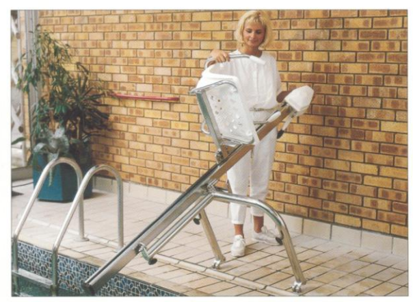
Locate the Otters' claw feet under the 'T' hooks and lower the unit into place. It is then ready for immediate use.