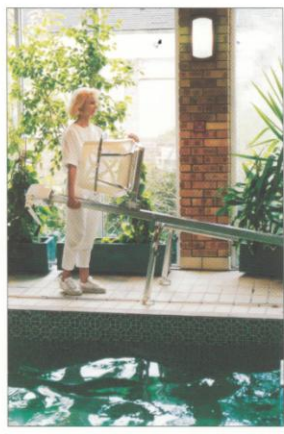
Bring the lift from where it is stored to the pool. The wheels make this easy.

It only takes a little help from you to lower the swimmer into the water.