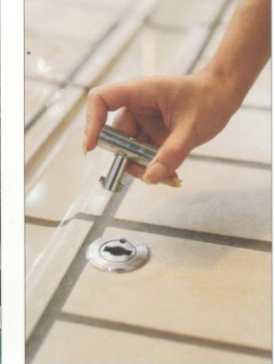
Fasten the 'T' hooks into the sockets. They are quick to fit and remove from the installation points, which are barely noticeable when not in use.