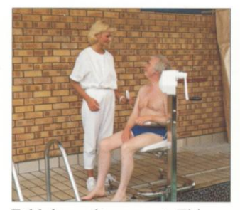
Fold down the armrest. This gives the swimmer security.