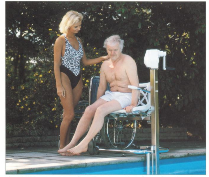
The fold-back armrest also allow for safe and comfortable side transfers from a wheelchair onto the seat.