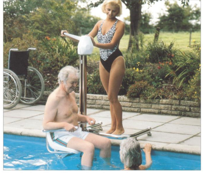
Turn the handle and lower the swimmer into the water. It is smooth, safe and takes very little effort.