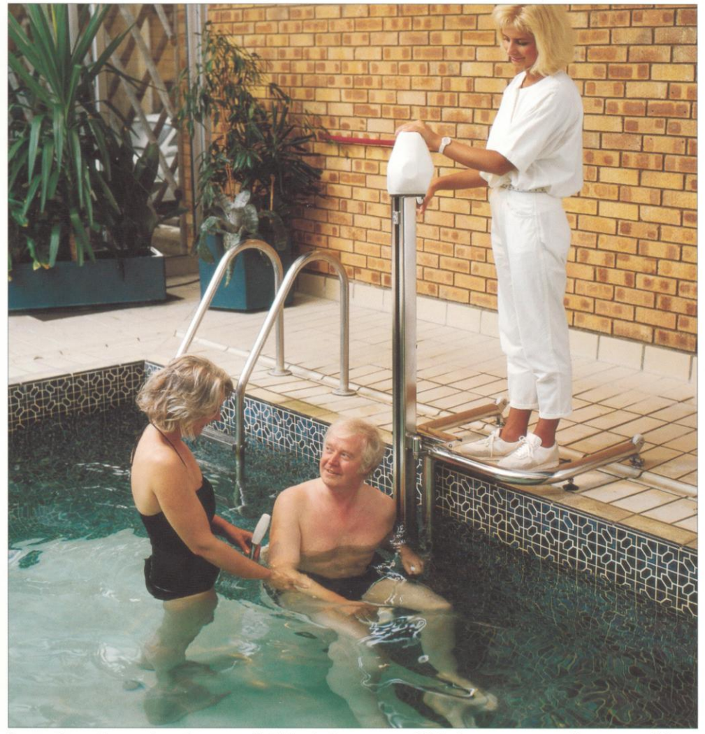
Lower the swimmer into the water. Fold back the armrest. With the water supporting some of his weight the swimmer can ease himself out of the chair on his own, or with some assistance.